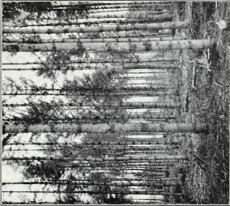
FIG. 2.—SAME STAND PROPERLY THINNED.